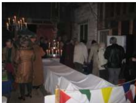
2-4-0 Club Launch